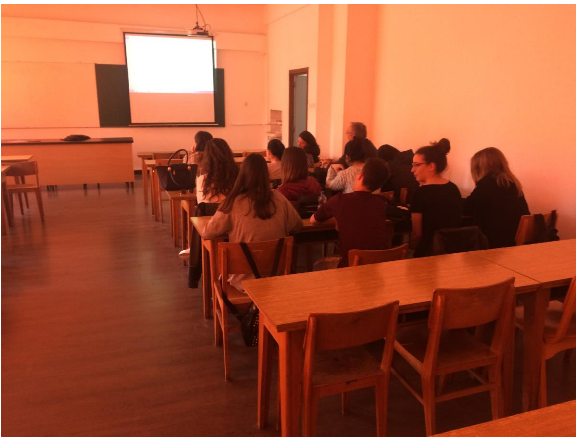
Title of Deliverable/Report/Document